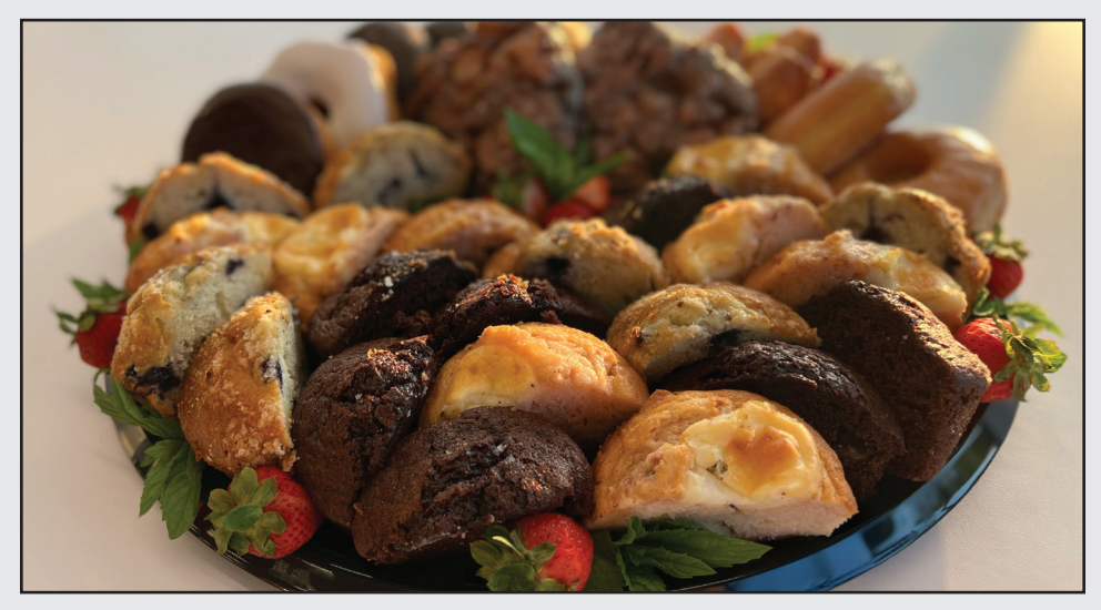
assortment of turano's freshly baked bagels with cream cheese, butter and jams assortment of turano's freshly baked donuts and danishes assortment of turano's finest freshly baked muffins